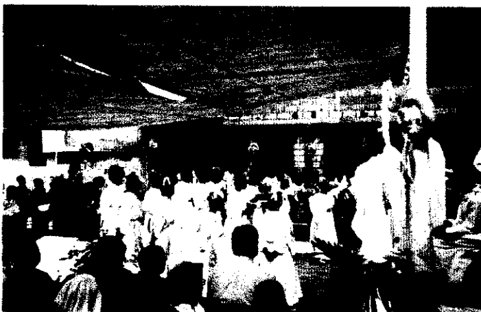
A SCENE FROM THE MASS CELEBRATING THE INAUGURATION OF UNIF JANUARY 4, 2004

The community of Fondwa celebrated the opening of UNIF 2004 on January 4th with a mass held at St. Anthony school. Many are working hard to see that this vision for sustainable rural development flourishes.