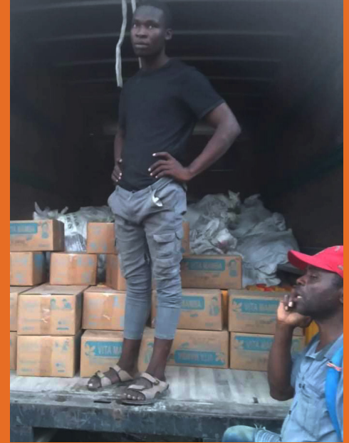
Vita mamba, a fortified peanut butter, being distributed in Duchity (left). Truck being loaded with food and other supplies for transport to earthquake-hit areas.