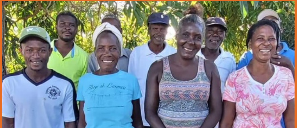
Two of the earthquake response teams, (Hinche (above) and Vye Kay) that provided food and assistance.