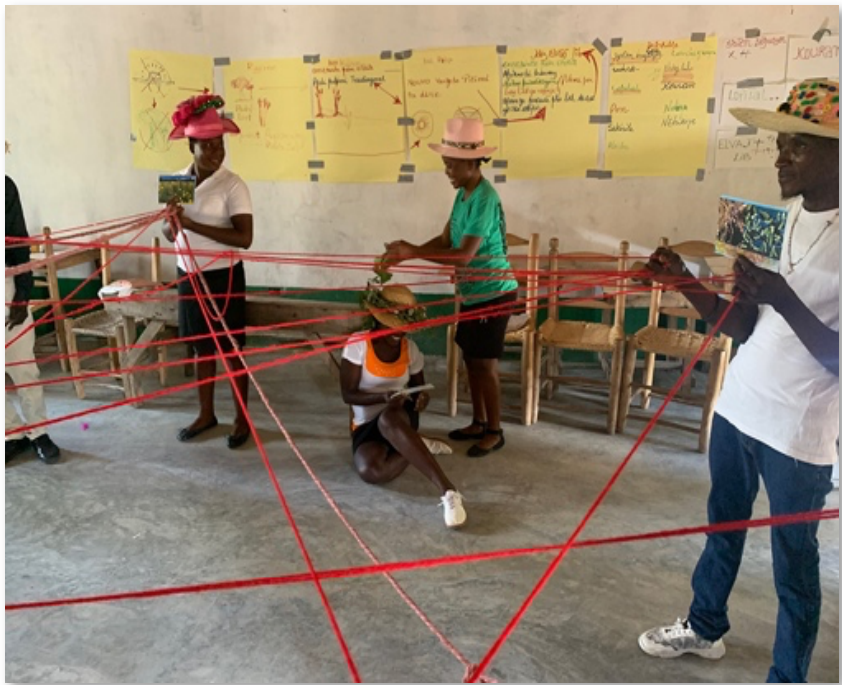
Agroecology Workshop participants play soil life game

There are few places on earth in so much need. Even before this dire and deteriorating situation, half of Haiti's 11 million residents were already experiencing acute hunger. I hope you will continue to stand with our community-based partners, FAFSI farmers, and other community members, to help them care for the thousands displaced by violence while continuing their vital work to ensure a better future for all.