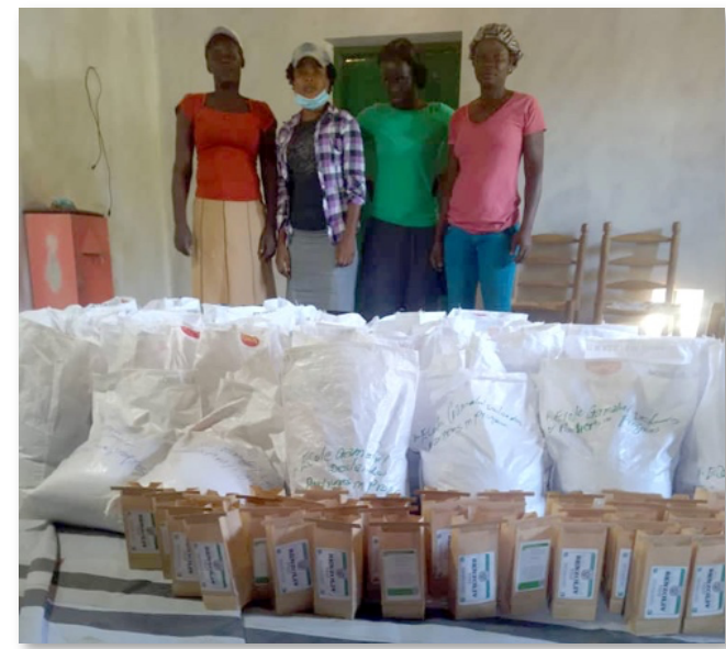
FAFSI Farmers with food kits for distribution